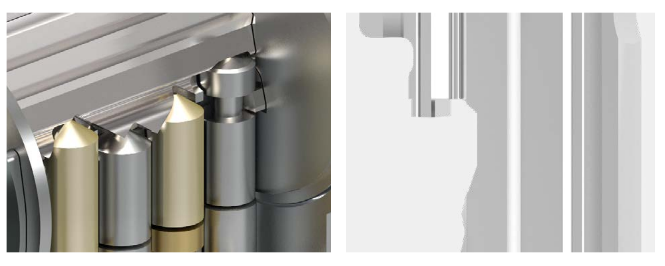
The Zolit locking system is fitted with the patented Intop system in both the cylinder and the key to provide effective protection against illegal key copies and manipulation of the lock cylinder.

The Zolit conventional locking system with vertical key insertion opens the door conveniently.