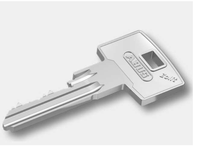
The high-quality, stable key is made from low-wear nickel silver to ensure long-term security.