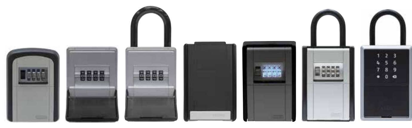
KeyGarage™ 707 KeyGarage™ 727 KeyGarage™ 737 KeyGarage™ 767 KeyGarage™ 787 KeyGarage™ 797