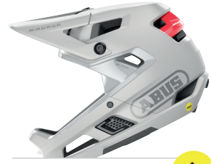
AIRDROP MIPS QUIN