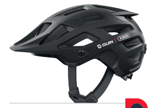
MOVENTOR 2.0 QUIN