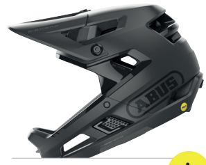
AIRDROP MIPS QUIN