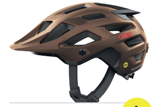
MOVENTOR 2.0 MIPS